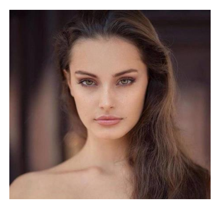
Spirit's avatar face

"Eve, I can see and sense only via a single link. What happened? Is the alien ship destroyed?"