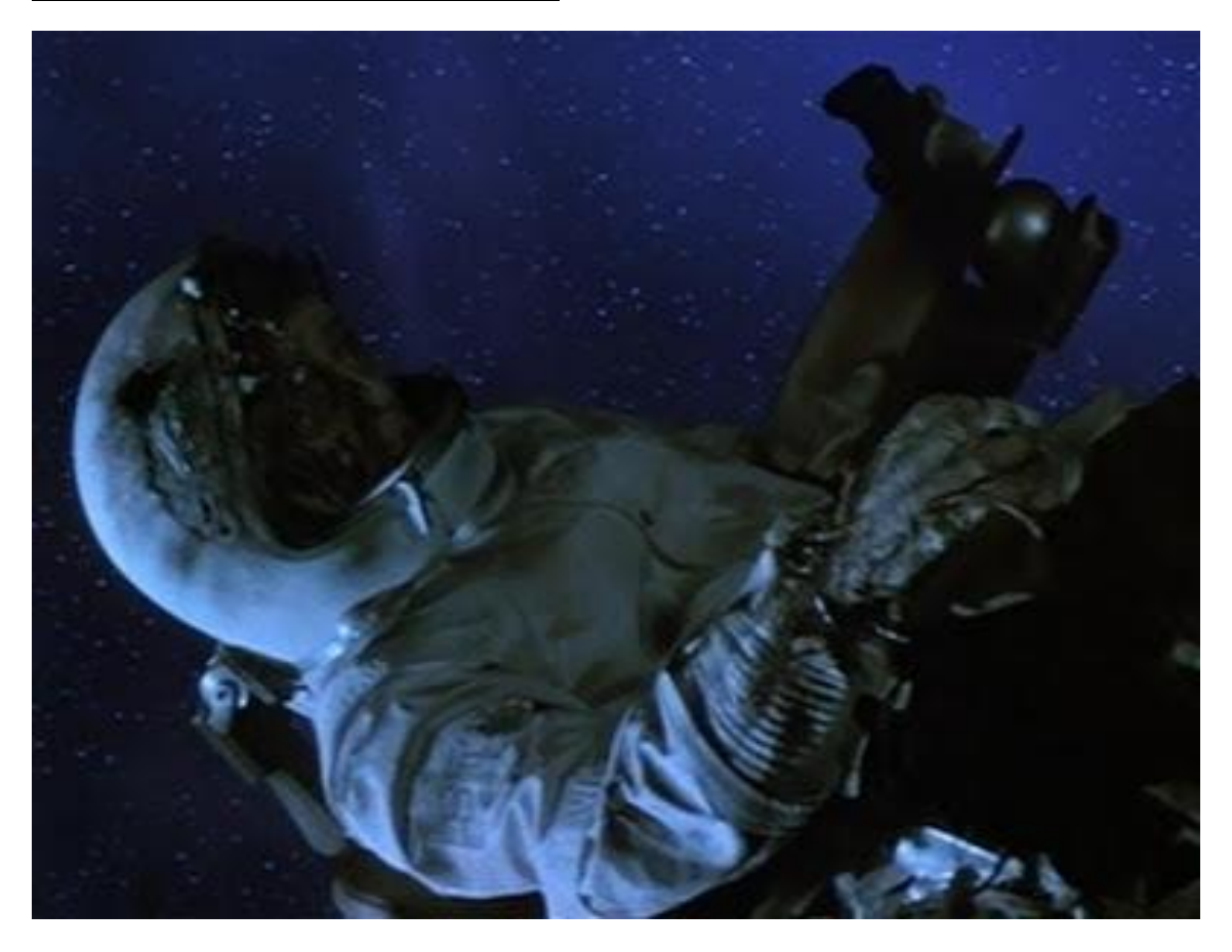
09:12 (New Dawn Time) Tuesday, January 5, 2332 Office of the Admiral of the Fleet, Navy Headquarters City of New Dawn, Providence (Alpha Centauri Bd) Alpha Centauri B System

"Again, I believe that we should execute this plan right now, when the enemy still had little time to react to the battle in the 55 Cancri A System, or even to become aware about it, Admiral."