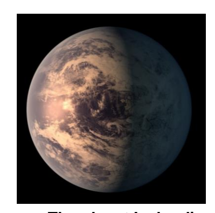
The planet Icelandia

Tina, having just returned from her lunch break, decided to review the latest news on the UniNet and check for messages before continuing her work at planning her next commercial transport trips. Business had been booming for her NOSTROMO since day one of its commissioning into service, thanks to the ever-increasing interstellar trade in goods, raw products and passengers around the Spacers' League and to the very limited number of ultra-heavy cargo ships available to carry large and heavy loads. In that aspect, the NOSTROMO was truly the king around, the same way the KOSTROMA had been before its destruction. From having spent months playing the small passenger star liner company while waiting for the NOSTROMO to be completed, Tina was now able to choose what transportation contracts she would take and what loads she would deliver, making in the process honest but also sizeable profits. That had in turn allowed her corporation to resume investing in the further development of New Haven and the expansion of its population capacity. Only three days ago, that had made possible the selection and relocation to New Haven of a new batch of refugees and homeless people from Earth, mostly from Africa and Asia.