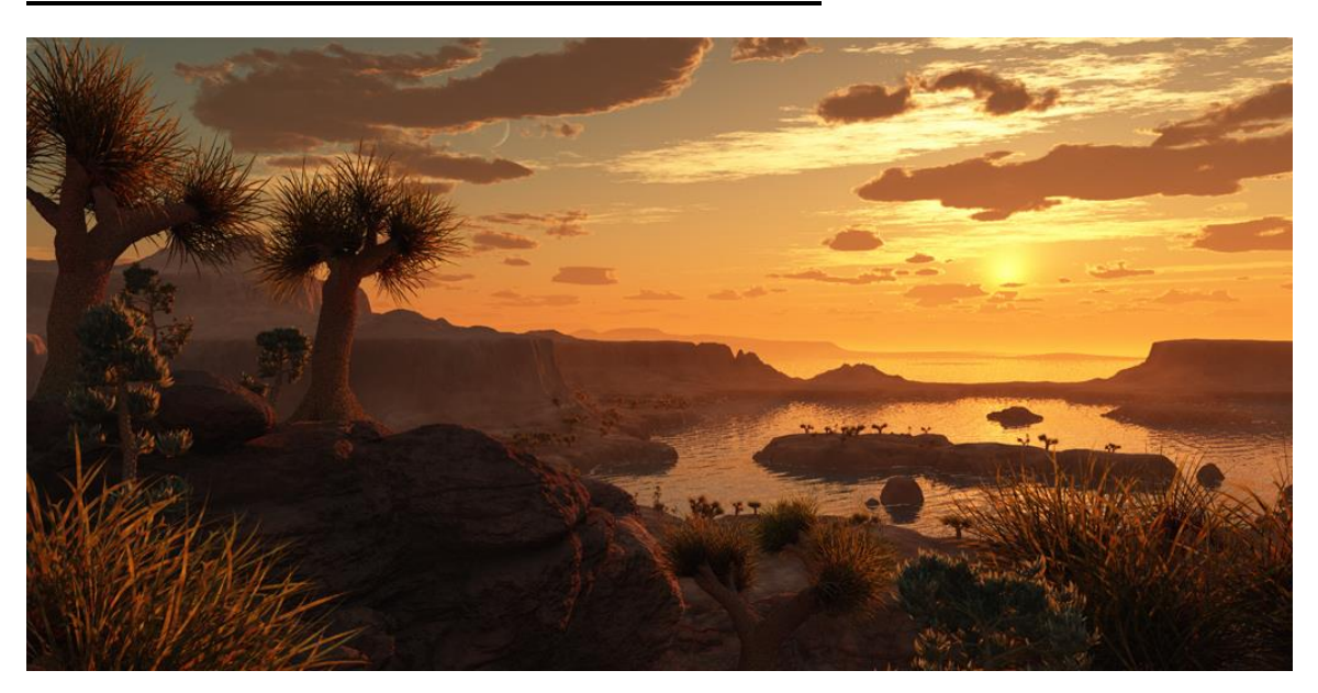
Wolf 1061 shining on the landscape of New Haven.