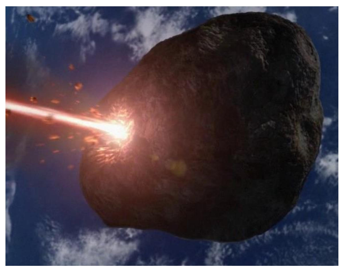
13:30 (Universal Time) Saturday, December 19, 2331 Bridge of the A.M.S. NOSTROMO Asteroid belt of the 55 Cancri A System, 41 light-years from Earth Constellation of Cancer