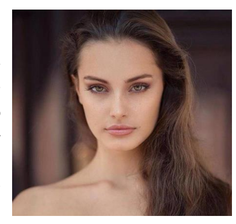
Spirit, in android avatar form.

statuesque, 192-centimeter-tall woman in her late twenties with green eyes and long brown hair. She wore a skin-tight ensemble of light blue leotard pants and blouse with a deep cleavage, plus a pair of kneehigh shiny black boots and a large black belt, to which were attached a number of black leather pouches with shiny silver fittings. If she would have walked into some dance club, she would have easily attracted men like flies to honey. Tina was not even sure either if women would not be attracted to her.