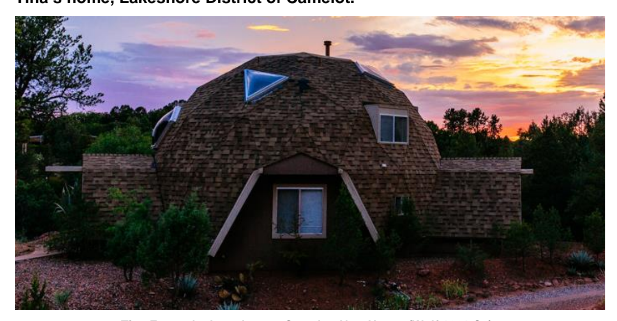
Tina Forster's dome house, Camelot, New Haven (Wolf 1061 Ca).

The red dwarf sun of New Haven was low on the horizon when Tina arrived at her dome house near the western shore of Lake Avalon. Her house was actually very similar in general aspect and size to most other residences on New Haven, for the simple reason that dome houses were ecologically-friendly and also easy to build with purely organic materials. They also had the benefit of offering lots of usable internal volume in a compact design, saving on needless waste of good arable land. Parking her scooter in the garage attached to her house, Tina then entered the basement level and climbed the stairs leading up to the main floor, ending up in the spacious combined lounge and dining room. She happily smiled on seeing her husband Michel and her son Misha eating at the dining table along with Zar Doz, her daughter Riza, Prime Minister Sho Dar and Dozna Wiss. The lot of them immediately got up from their chairs to greet her, with Michel and Misha hugging and kissing her. While most happy to see them all, she couldn't help look with concern at her eight-year-old son, who was sporting a large bruise on his left cheek.